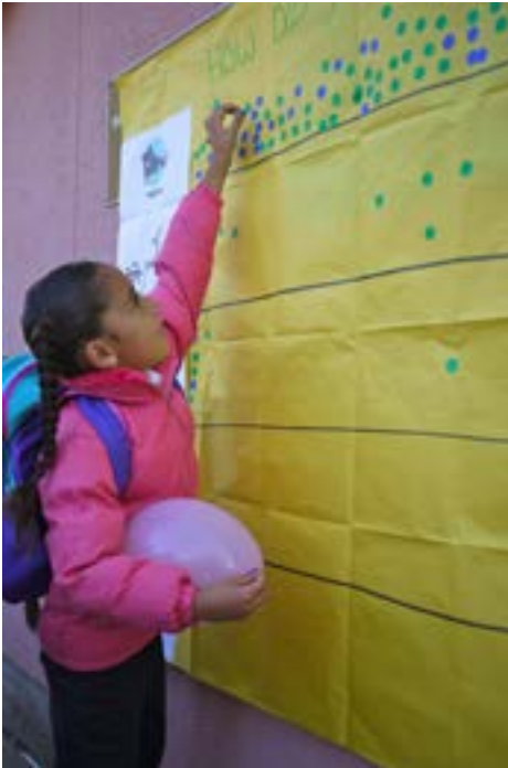
Students report how they got to school as part of Walk to School Day in Alameda County

Data can tell the story of how activities and events can encourage walking, bicycling, carpooling, and riding the bus. Statistics about how many students are participating in Walk and Roll to School Day or how many emissions the third grade saved over the year can educate parents, school administrators, city or county staff, elected officials, and students themselves about how programs and infrastructure improvements benefit their lives and the community. This information helps guide policy and funding decisions in order to maximize impacts and help provide funding equitably.