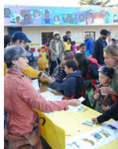
Evaluating the success of an event allows a program to focus on those activities and events that will truly create mode shift toward walking and bicycling.

Survey teachers a few weeks after kickoff to ask to identify program strengths and potential improvements. Send a second survey to teachers six months or longer after kickoff to evaluate the effectiveness of the program, focusing on how well the program reaches students.