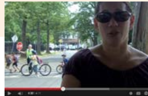
New Jersey SRTS addresses common concerns from parents in this humorous Things Parents Say video. www.youtube.com/watch?v=OWZPnFaz7jA