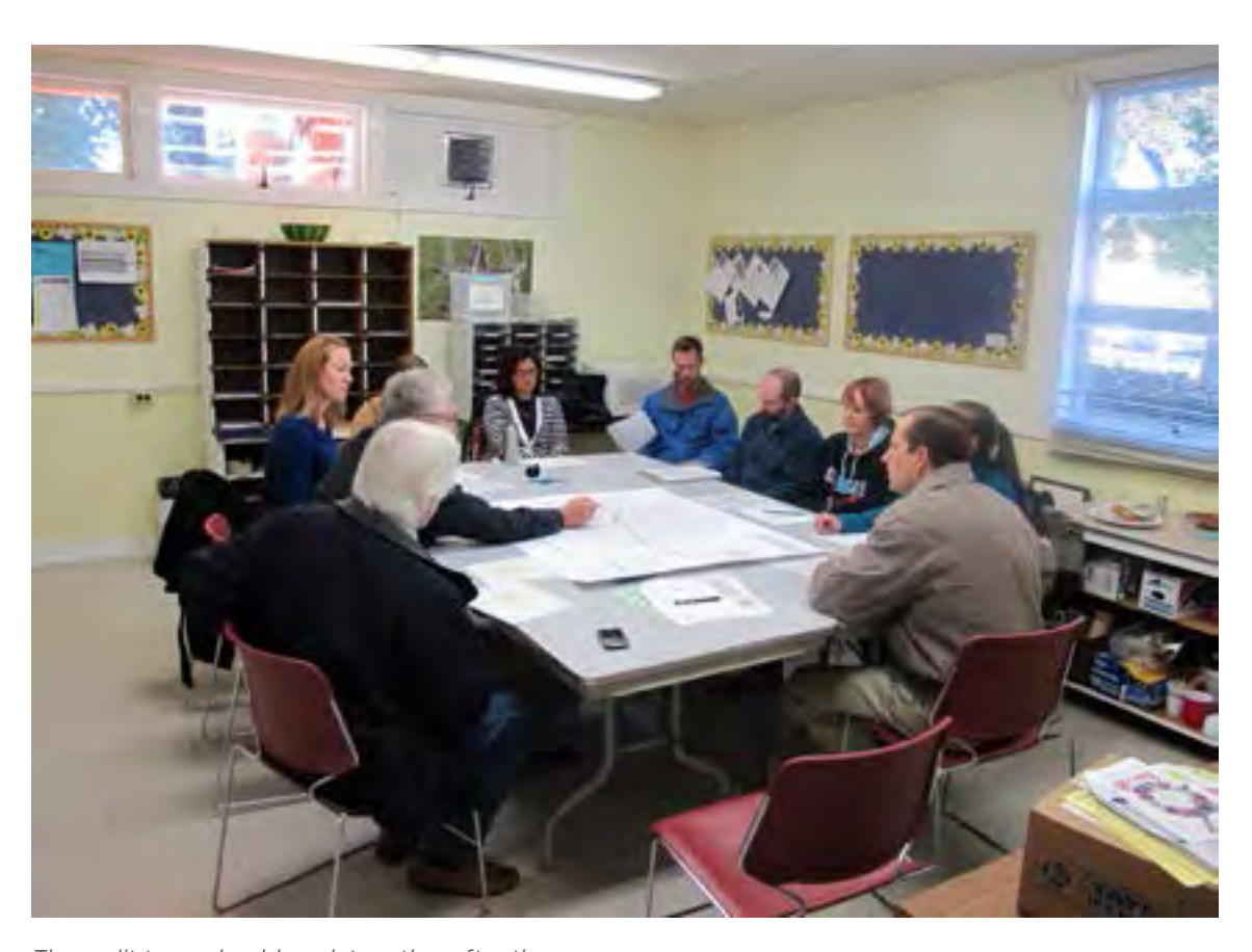
The audit team should work together after the audit to identify and prioritize potential solutions.