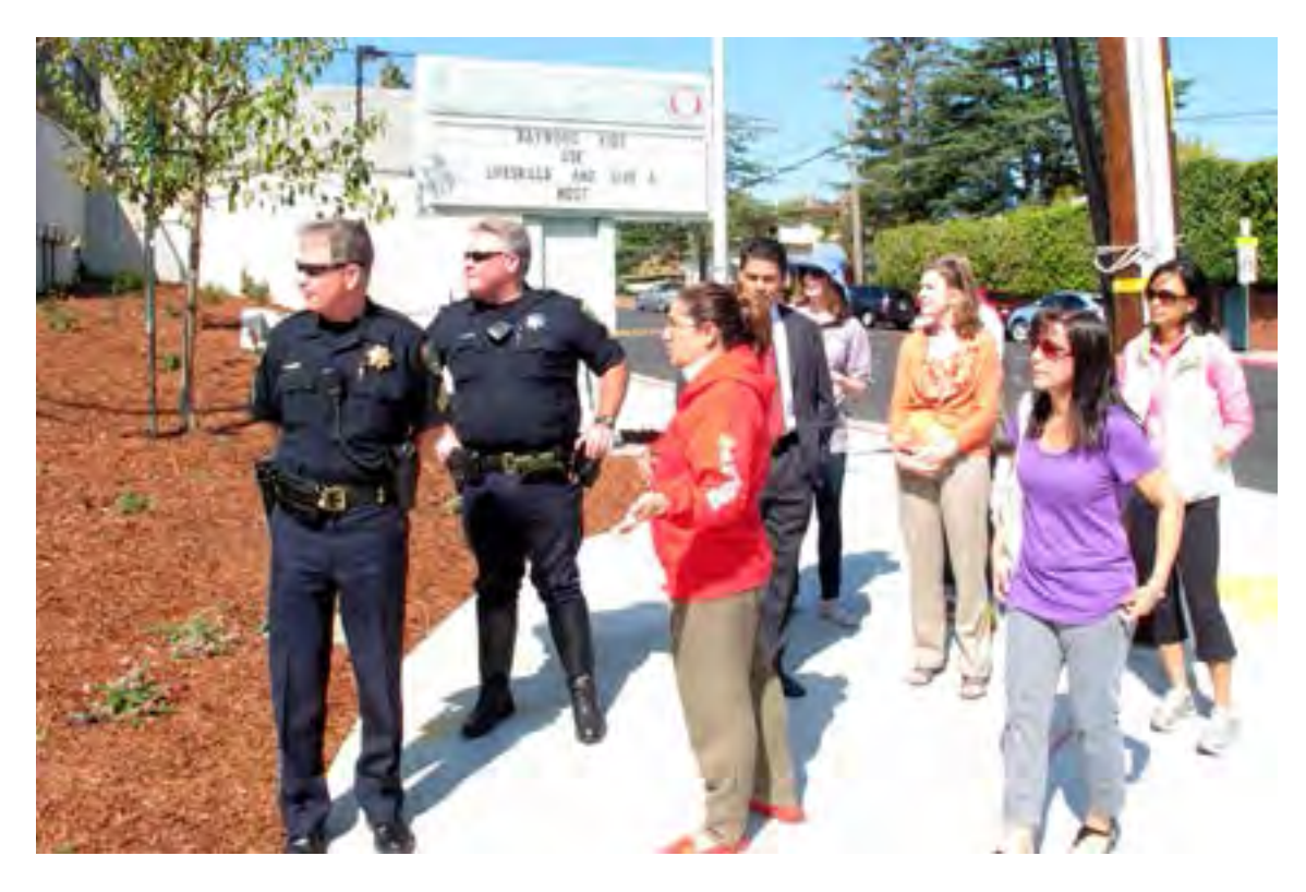
School stakeholders include parents, children, school staff, and school district officials, while technical stakeholders include public works or traffic department staff, local engineers or planners, and law enforcement officials.