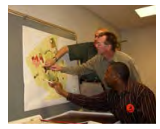
Parents identifying potential issue areas and audit route.