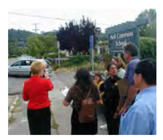
School stakeholders should highlight barriers and challenges, while technical stakeholders should note potential solutions.